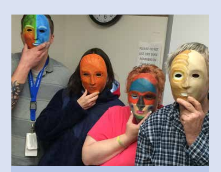
The Kentucky Center Arts in Healing program in Louisville, Kentucky facilitates the creative self-discovery and artistic expression of patients, caregivers, and staff through 38 programs in 23 healthcare facilities.