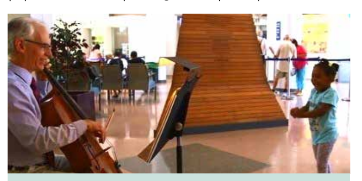
The Arts in Medicine Program at The MetroHealth System in Cleveland, Ohio offers music, dance, theater, visual arts and community arts programs, and provided over 700 hours of live music programming in 2016.

Significant growth of the arts in health arena can be witnessed in the public health context, with many programs now exploring ways that artists, creative arts therapists, and expressive arts therapists can contribute to community health goals. Generally, these programs benefit communities by engaging people in arts programs intended to promote prevention and wellness activities. The arts in this context are also used effectively to communicate health information to improve health literacy. Important new developments in community health include a focus on age-friendly community services, caring for military and veterans' populations, addressing health care needs of people with chronic illnesses, caring for homeless populations, and responding to the opioid epidemic.