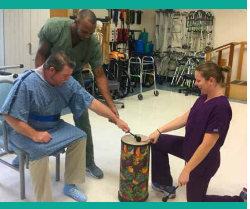
Music therapists at <u>Tallahassee Memorial HealthCare</u> work in inpatient and outpatient settings to assist patients in meeting crucial health goals. Community classes, professional training, and research round out the offerings of the program.

In partnership with Florida State University, Tallahassee Memorial HealthCare (TMH) offers the region's most comprehensive music therapy program and a national training site for future music therapists. Music therapy is used to help with physical, emotional, cognitive, and social needs of children and adults. The FSU/TMH partnership for Medical Music Therapy and Arts in Medicine was established in 1999. Board-certified music therapists oversee the program and help coordinate students, interns, and non-credentialed volunteers.