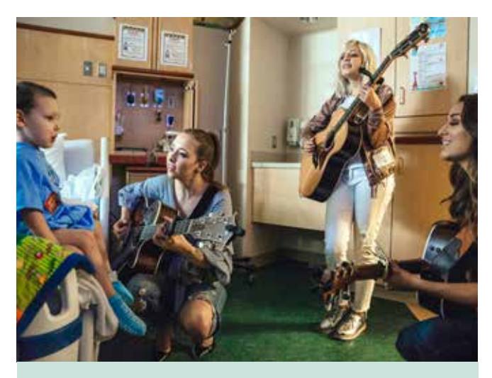
Musicians on Call, based in New York City, matches volunteer musicians with healthcare facilities to provide bedside music services. The program has now expanded to 20 cities throughout the nation.

There is nothing new about artists engaging in healthcare settings such as hospitals, hospices, nursing homes, and long-term care centers. For many decades, visual artists and performing artists have provided arts experiences that have enhanced the environment of care. But as experience, education, research, and professionalism have contributed to the ongoing advancement of arts in healthcare programs, best practices are emerging that can guide program administrators and artists in implementing programs that will yield clear benefits to patients and caregivers, and also comply with established standards for patient safety and professionalism.