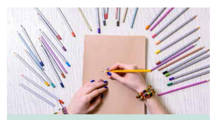
The National Association for Poetry Therapy (NAPT) is a nonprofit international and interdisciplinary organization promoting growth and healing through written language, symbol and story. NAPT includes members from a wide range of disciplines and writers of all styles.

The mission of the National Association for Poetry Therapy, founded in 1969, is to promote growth and healing through written language, symbol, and story. Incorporated in 1983, the International Federation for Biblio/Poetry Therapy sets standards of ethical practice and excellence in the training and credentialing of poetry therapists and authorizes qualified individuals to function as mentors/supervisors. The Federation awards the designations of Certified Poetry Therapist (CPT) or Registered Poetry Therapist (PTR).