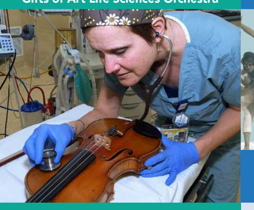
The Gifts of Art's Life Sciences Orchestra members continue to make music a priority despite demanding medical and health science careers. The Orchestra annually performs two concerts of challenging symphonic repertoire.

Founded in 2000, the Life Sciences Orchestra is the symphonic orchestra for members of the life sciences community at Michigan Medicine at the University of Michigan in Ann Arbor. One of the branches of the Gifts of Art program, the Orchestra is comprised of doctors, nurses, staff and students at the University of Michigan Medical School and related Life Sciences departments. The Orchestra was created in the fall of 2000 by a small group of musicians. Now in its 18th season, the ensemble draws nearly 2,000 audience members for each of its two free annual concerts.