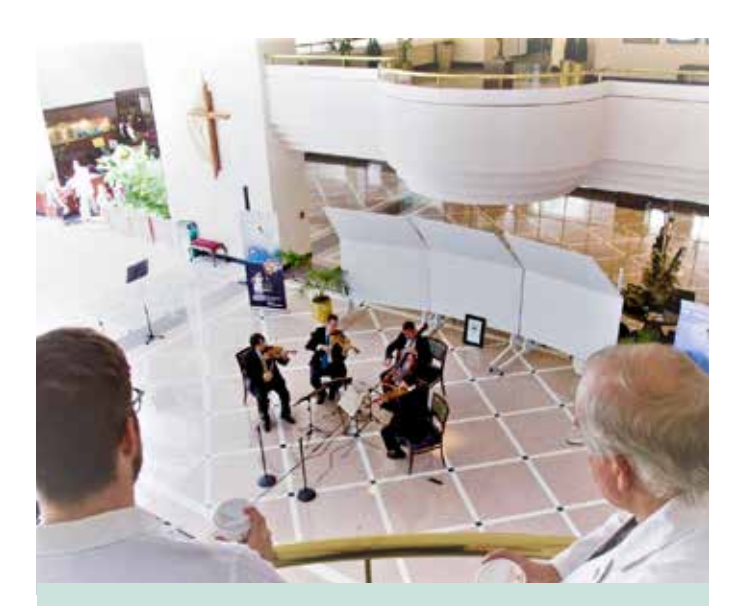
The Center for Performing Arts Medicine at Houston Methodist Hospital provides unique healthcare services for performing artists as well as arts offerings throughout the facility. Over 150 performances are given annually in the hospital for patients, caregivers, family, and community members in Houston, Texas.