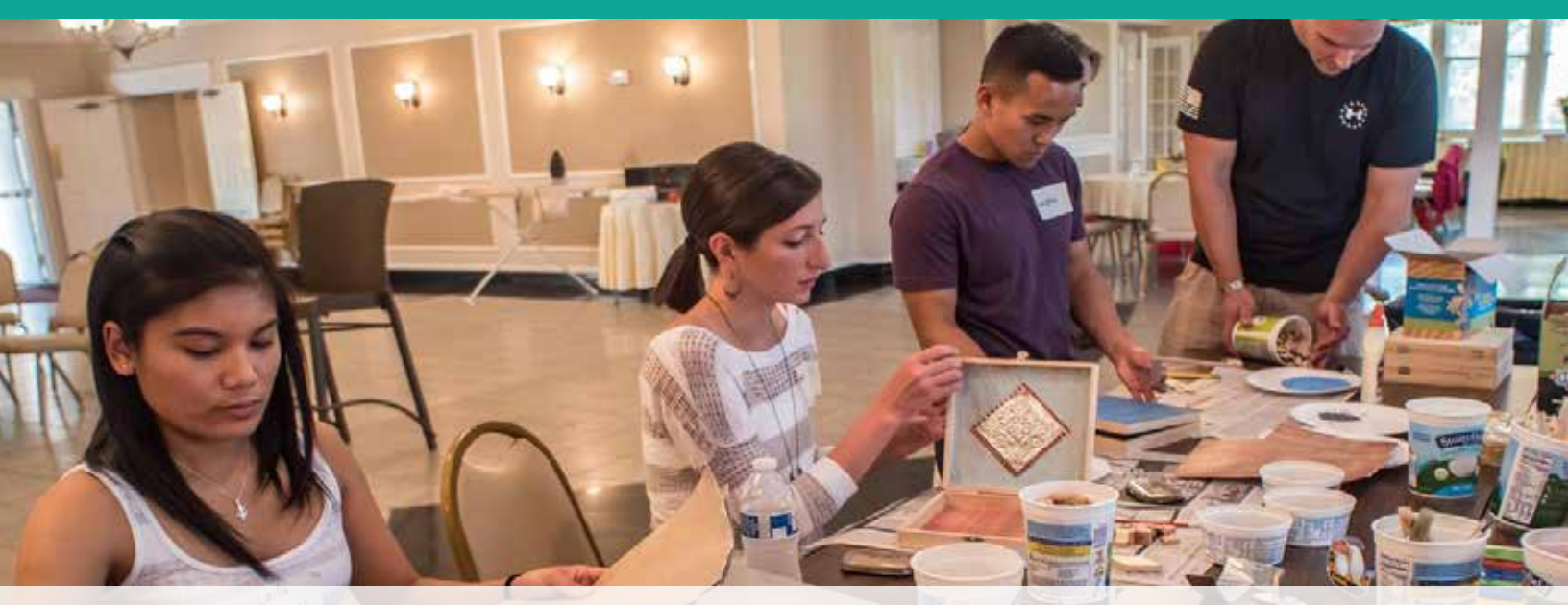
The ArtStream program's You Are a Work of Art initiative holds off-base retreats to improve the coping skills and morale of nursing staff working on the Wounded Warrior unit at Walter Reed National Military Medical Center through arts learning and engagement.