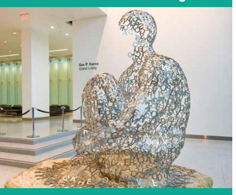
Jaume Plensa, Cleveland Soul, 2007, stone and steel. The commissioned sculpture was placed at the entrance to the hospital and is set on a 5-ton boulder. The Cleveland Clinic Art Program features over 6,000 works by national and international artists.

The Cleveland Clinic's Art Program is one of the most extensive hospital collections in the nation. An Aesthetics Committee was appointed in 1983 to begin addressing the need for art in the hospital. In 2006, the Art Program was founded. In 2017, a full-time executive director and two full-time curators, among other staff, maintain the over 6,300 pieces of art in permanent and rotating exhibits.