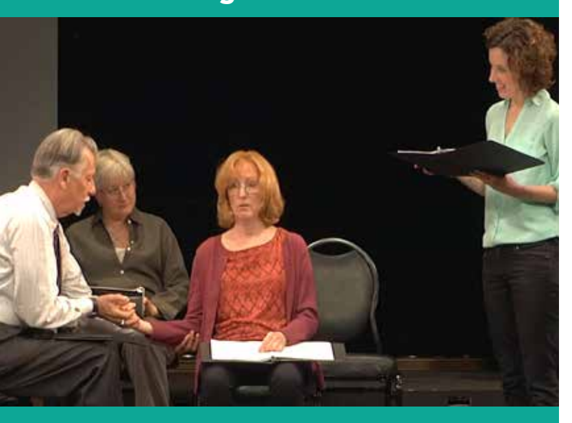
Healing Voices OnStage: Caregivers' Stories is a collaboration project theatre community. Caregivers' stories are staged and performed by professional actors in an annual festival in Morristown, New Jersey.

Healing Voices OnStage: Caregivers' Stories is a theatre project that weaves caregivers' stories about their experiences into a production that reflects both the diversity and universality of the caregiver experience. The project is a collaboration among Healing Arts at Atlantic Health System, the New Jersey Theatre Alliance, Writers Theatre of New Jersey and Premiere Stages at Kean University.