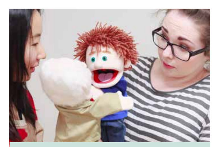
The North American Drama Therapy Association (NADTA) was incorporated in 1979 to establish and uphold high standards of professional competence and ethics among drama therapists, to develop criteria for training; to sponsor publications and conference; and to promote the profession of drama therapy.

Through the NADTA, drama therapists are credentialed as Registered Drama Therapists (RDT) upon completion of their training and initial professional hours. RDTs must have skills and competencies in drama and theatre as well as in psychotherapy and therapeutic intervention. Similar to other CATs, licensure efforts in various states have allowed drama therapists to gain employment, bill insurance companies, and promote their practice. Drama therapists are currently working for recognition in states where there are larger groups of RDTs. Many drama therapists are also licensed in other related professions such as counseling, marriage and family therapy, and social work.