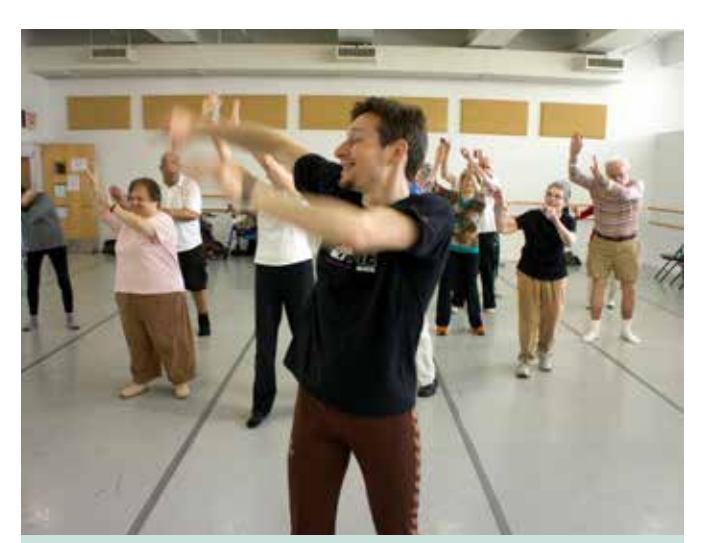
The Mark Morris Dance Group's Dance for PD® program invites people with Parkinson's and their families in 17 countries around the globe to experience the joys and benefits of dance while creatively addressing condition-specific concerns.

The John F. Kennedy Center for the Performing Arts in Washington, DC supports state coalitions providing arts services to promote artists with disabilities and to offer accommodations for people with disabilities to participate fully in arts engagement for better health and education.