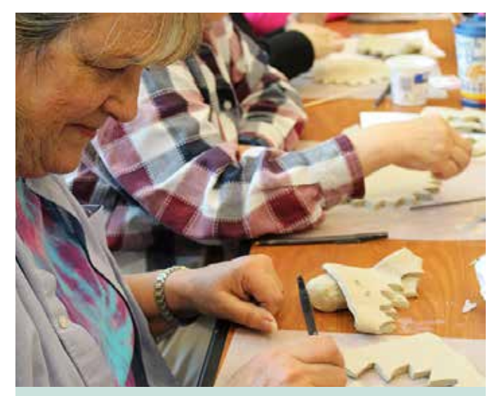
The Samaritan Cancer Resource Center in Albany, Oregon hosts monthly arts workshops for cancer survivors and their families through the Samaritan ArtsCare Program.

The urgent need for professionalization of artists working in healthcare settings, healthcare arts administrators, and healthcare arts consultants has been noted throughout this paper. NOAH is currently working with the Arts in Health Certification Commission on the development of national standards for training and credentialing of artists in healthcare, and plans are in place for a future focus on healthcare arts administrators. Although this important work is underway, much remains to be done in supporting the process of professionalizing the field. Introducing and coordinating the launch of national standards and credentialing processes will require a robust infrastructure of organizational support, as well as excellent partnerships across the arena and with educational institutions. NOAH has prioritized this action step as a national goal, and is eager to partner with others to move forward with continued growth and professionalization of Arts in Health.