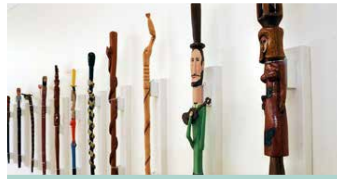
The UK Arts in HealthCare Program at UK Albert B. Chandler Hospital in Lexington, Kentucky brings together visual and performing arts, incorporating the unique aspects of Kentucky's landscape, art and music. Kentucky Folk Art Canes, Various artists.

Whereas the primary purpose of visual art displayed in healthcare settings continues to be the engagement, relaxation, and stress reduction of patients, staff, and visitors, curators of permanent art collections and rotating exhibits are increasingly broadening their selection criteria to address additional goals of visual art selections. Evidence-based design emphasizes the power of natural landscapes as a healthful visual stimulus. Hospital art directors and committees sometimes prefer representational art that contains soothing and recognizable images that are easily understood, such as nature and soothing water scenes. However, it can be argued