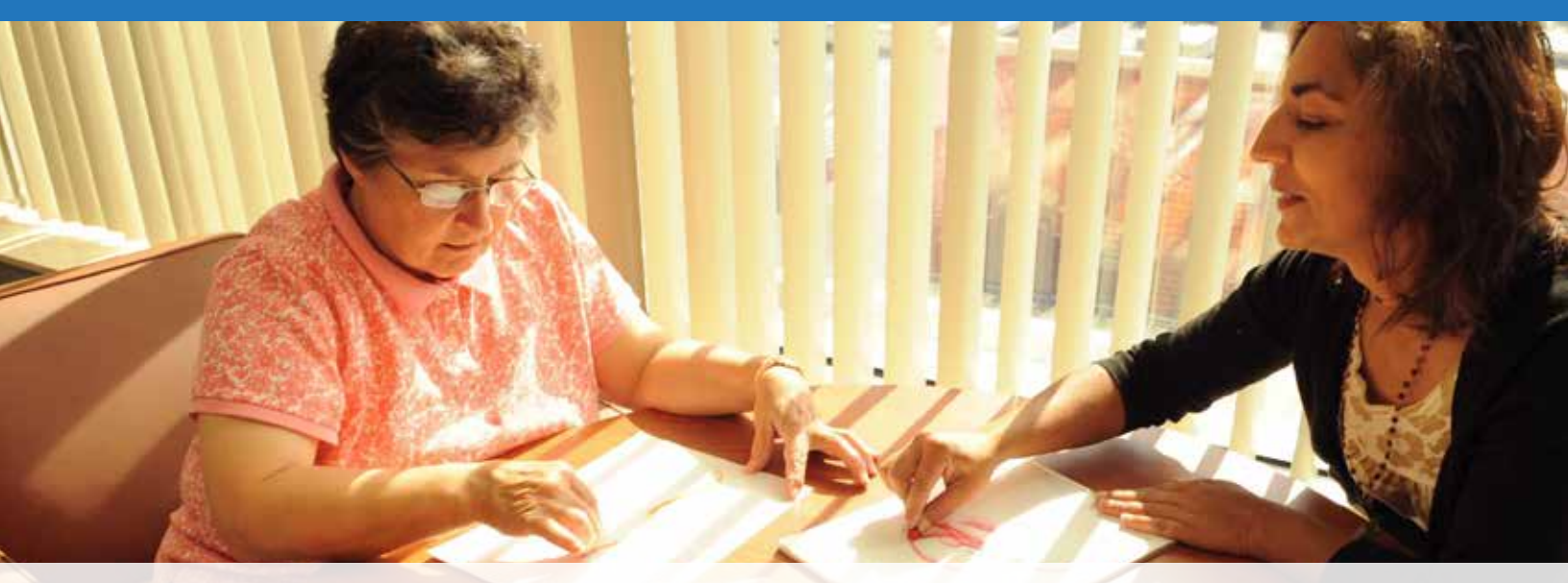
The Arts in Healthcare Initiative, established by the University at Buffalo Center for the Arts, brings arts programming to the patients, visitors, and staff at healthcare facilities in Buffalo, New York.