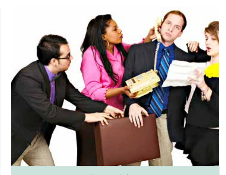
Kaiser Permanente's Educational Theatre program in the Georgia region holds 60-minute productions entitled "Acting on Stress" for adults. Through drama and guided discussion, adults receive education and skills for dealing with stressful work and personal situations.