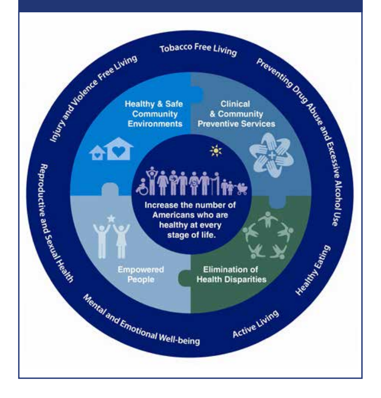
FIGURE 2: Strategic Directions and Priorities of the National Prevention Strategy, U.S. Department of Health and Human Services

In contributing to public health, the arts can be considered as part of the larger field of health humanities, a term that refers to the application of diverse creative arts and humanities disciplines to discourse about, express, and/or promote dimensions of human health and well-being (Jones, Blackie, Garden, & Wear, 2017).