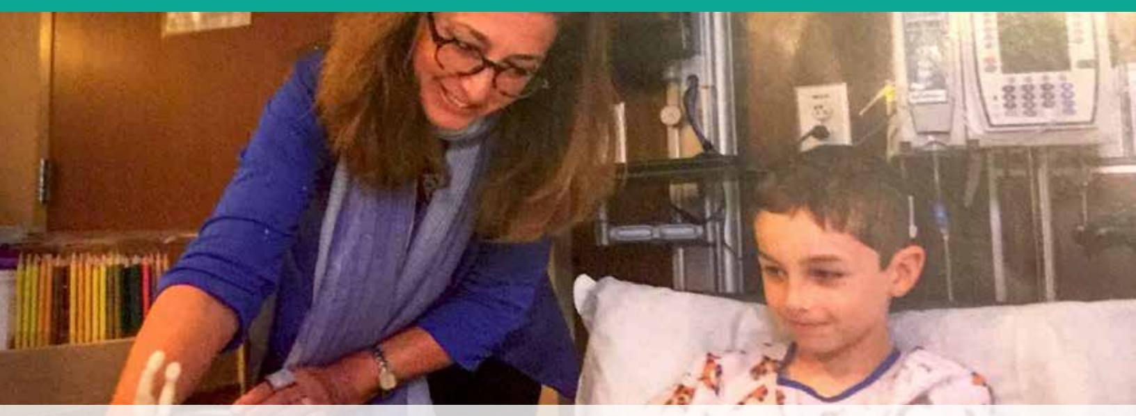
The Healing Hands Mobile Art Program at Capital Health in Hopewell, New Jersey provides patients of all ages and illnesses the opportunity to use art as a means of expression and healing in the comfort of their own hospital rooms.