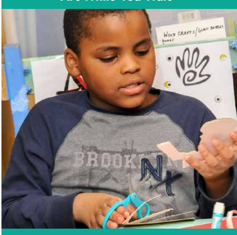
A patient in the waiting area of the Hasbro Children's Hospital emergency department participates in Art While You Wait activities. The hospital has documented positive results in patient experience and satisfaction levels after implementing the program in 2003.

The Art While You Wait program at Hasbro Children's Hospital in Providence, Rhode Island was designed to help alleviate fear and provide positive distraction for children and their families waiting for medical treatment in an emergency department waiting area. A branch of the Healing Arts at Lifespan program, Art While You Wait is based on a national model created by The Art for Life Foundation.